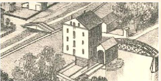
The 1834 mill, with canal on left and millrace and river on right. From 1876 map.

two blocks south of the mill. Canal Street was no street—rather, the canal itself, running toward Sharon.