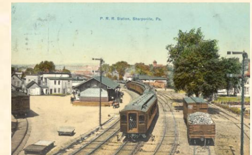
Pennsylvania (E & P) Rail Station with tracks of the Sharpsville Railroad to the right

After the block coal mines became depleted, the Sharpsville Railroad entered a long somnolence: For 34 years it operated while in receivership, and at the end only serviced local farms and carried students to Westminster College. The "Hoodle Bug", as the Westminster students dubbed it, ceased to run in 1930.